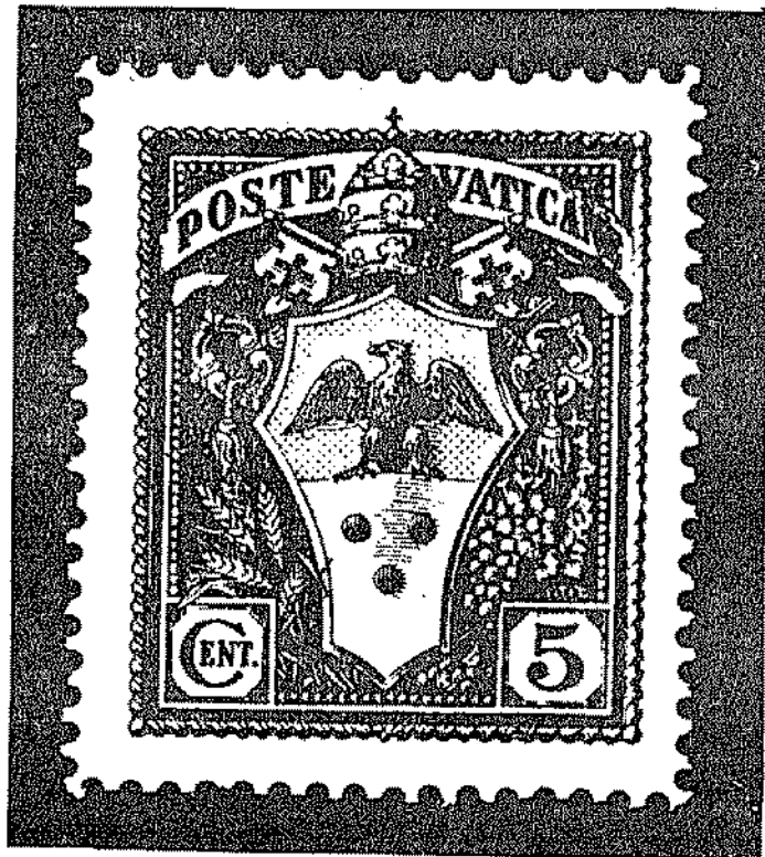
Arms of Pius XI A14

First Day of Issue: May 31, 1933 Last Day of Validity: #42 & #51-54 December 31, 1940 #43-50 & #56-59 February 28, 1947 Designer: #43-50 & #58-59 F. Schirnbock #42 & #51-57 Enrico Federici Printer: State Printing Office, Rome Printing: Unknown Printing Method: Engraved Engraver: Unknown Watermark: Crossed Keys Perforation: Block perforated 14 Stamps per Pane: #42-50 100 stamps #51-59 50 stamps Type of Issue: Regular