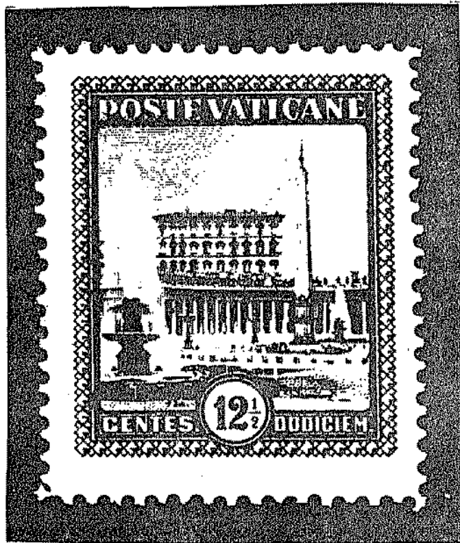
Apostolic Palace A15