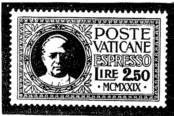
Pope Pius XI A3

The stamps of this type were issued to prepay the special delivery rates.