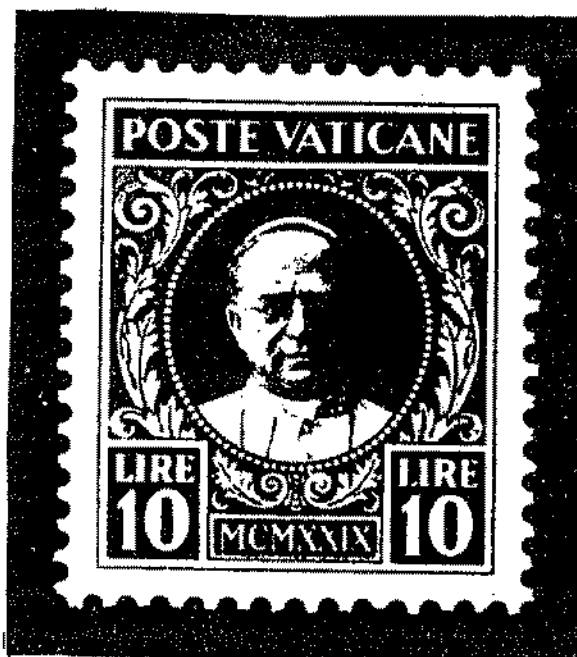
Pope Pius XI A2

The stamps of this type were printed on white paper