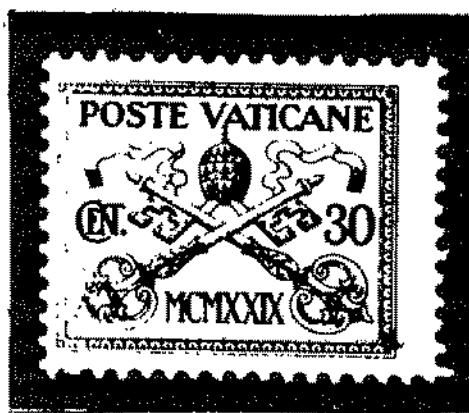
Papal Tiara & Crossed Keys A1

First Day of Issue: August 1, 1929 Last Day of Validity: December 31, 1933 Designer: Enrico Federici (?) Printer: State Printing Office, Rome Printing: Unknown Printing Method: #1-7 Engraved #8-15 Photogravure Engraver: Unknown Watermark: None Perforation: Block perforated 14 Stamps per Pane: #1-13 100 stamps #14-15 50 stamps Type of Issue: Regular Inscription: One sheet of _ stamps value _ in the left margin